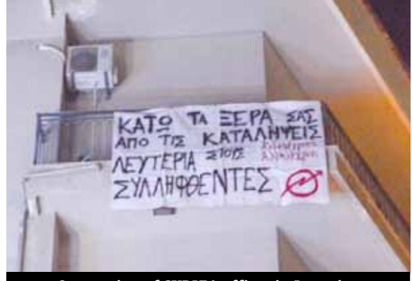
Occupation of SYRIZA offices in Ioannina