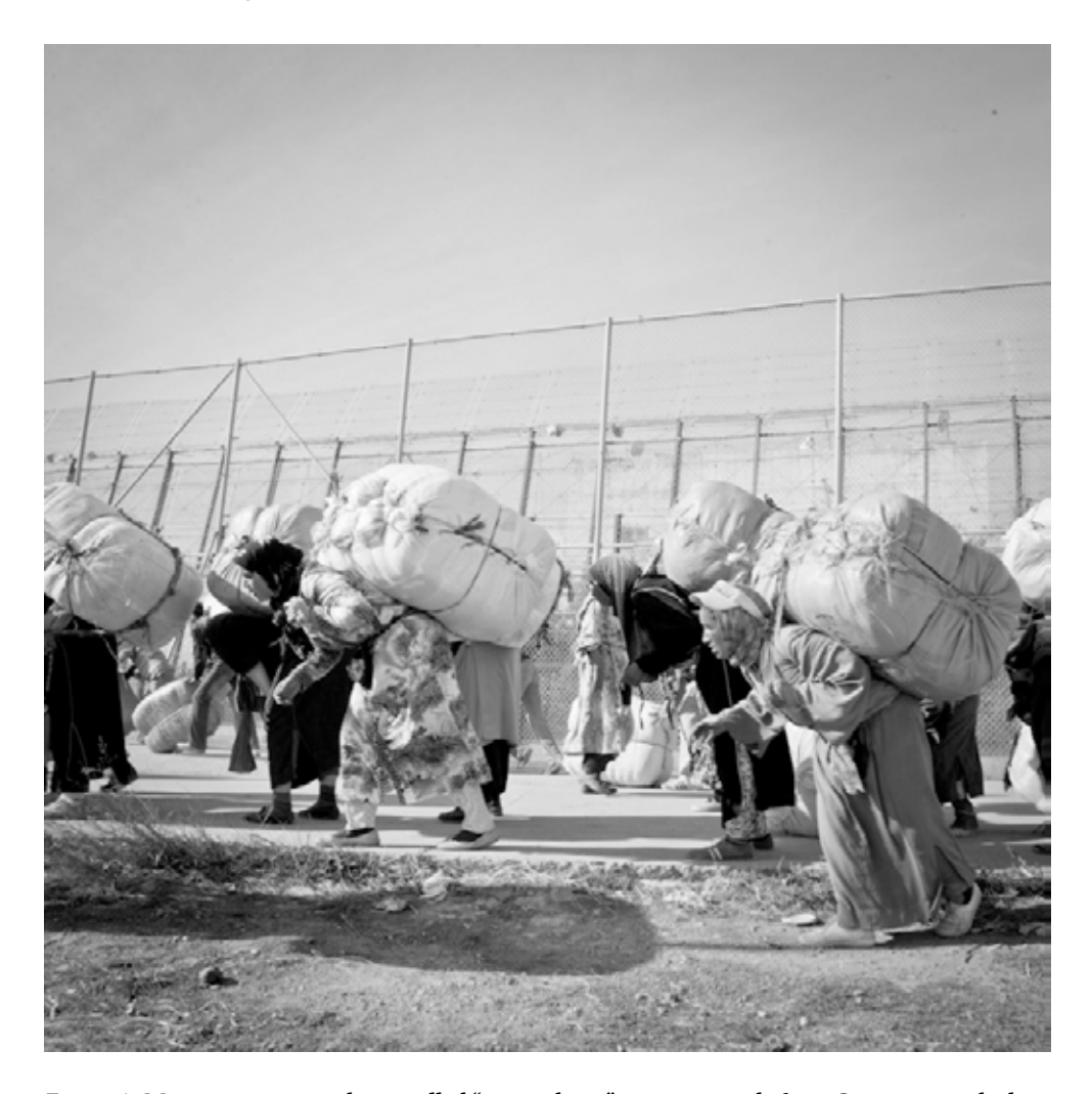
Figure 1: Moroccan women, the so-called "porteadoras" carrying goods from Ceuta across the border into Morocco.

trarily at the entrance to the Spanish enclave. The informal business in Ceuta and Melilla represents a significant revenue, the net profit of the informal sector is estimated to even surpass that of all legal exports between Spain and Morocco. Up to 80% of all goods that arrive at Ceuta and Melilla end up in Morocco. This means that Morocco constitutes a key outlet for the two enclaves which profit notably because of fiscal advantages and the exploitation of workforce.