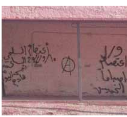
Diavata "open camp". Graffitis calling for the September 1st, 2016, migrants protest in Thessaloniki.