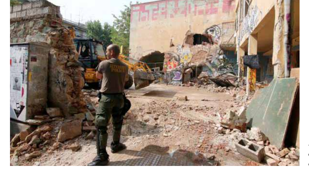
Eviction and instant demolition of Orfanotrofeio squat.

We had not realized how threatening these relations and these assemblies are for the powers that be. Now we have, we are determined to confirm this threat by continuing our struggles. This, of course, is a matter of practical actions and of collective organizing. It is not a matter of words. However, this retrospective text consists of words only, so let us add a few more.