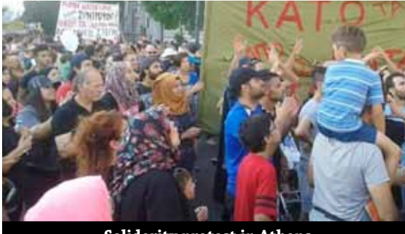
Solidarity protest in Athens