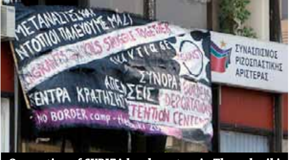
Occupation of SYRIZA headquarters in Thessaloniki