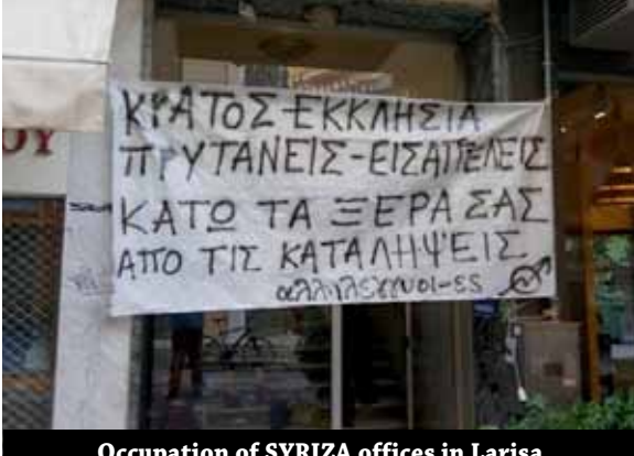
Occupation of SYRIZA offices in Larisa