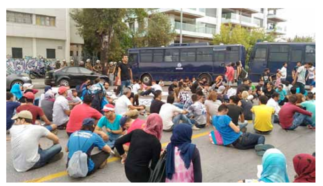
September 1st, 2016, self-organized migrants protest in Thessaloniki.