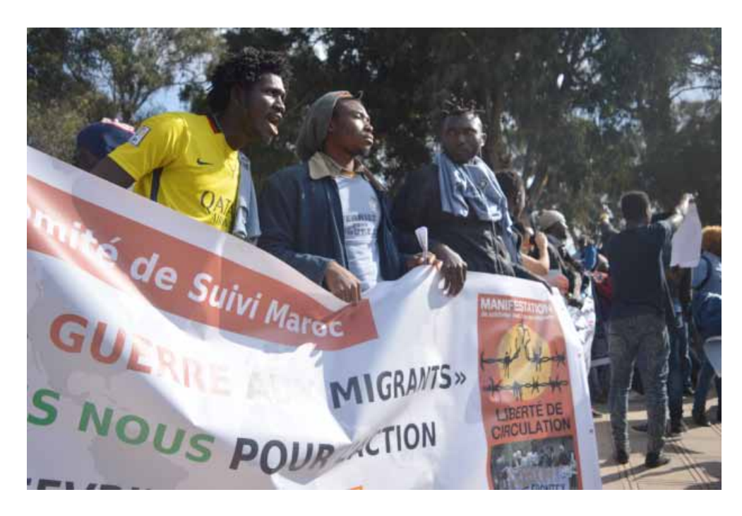
Figure 3: The Rabat demonstration on February 6th, 2016

Mostly sub-Saharan migrants, but Moroccans in solidary as well, made their way to the capital from Tangier, Tetouan, Nador, Oujda, Fez, Meknes, Casablanca, Tiznit and