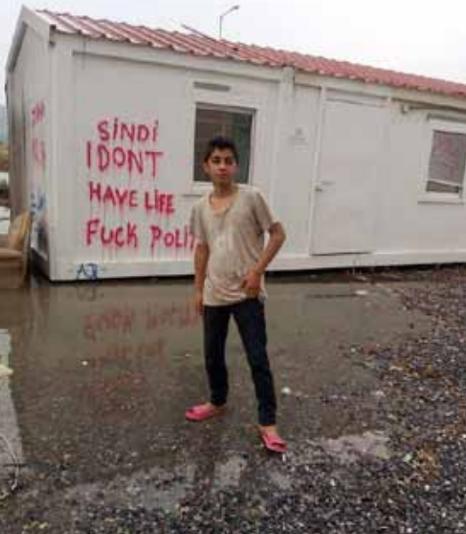
Left: Eviction of Nikis squat and (right) the alternative, after the eviction of housing squats for migrants in Thessaloniki: luxurious life in a State-run camp.

Perhaps the residents of this city do not know that after the evacuation, the police had exact orders as to the number of migrants it could arrest, so that Toskas could then be able to speak of "32 people". The police had exact orders as to what kinds of people it would arrest, so they were careful not to touch families and children, because images of crying babies in police vans would then speak louder than the talking heads of State propaganda. The residents of this city did not see the gleeful smile on the faces of riot cops as they were denying entry to the evacuated Orfanotrofio squat to a person who wanted to bring out from the debris the medication for a diabetic migrant who had just been arrested. These reality snapshots might be buried under the tons of dust of the bulldozer, but all the dust and detritus in this city cannot cover up the brutality of the authorities.